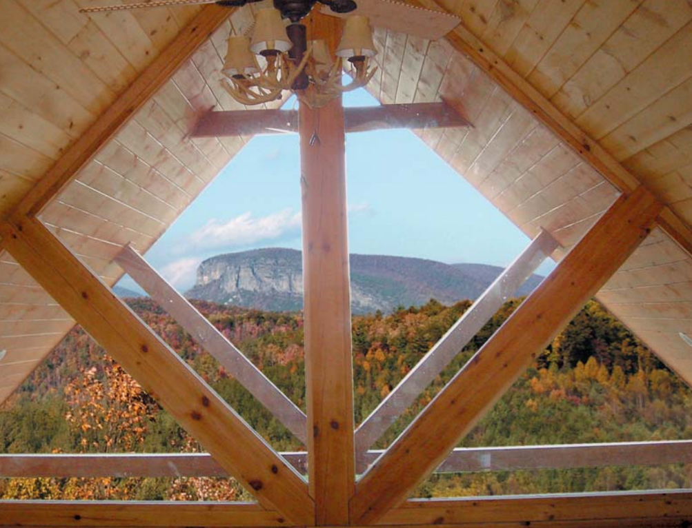
View of Shortoff Mountain from inside "The Ridgeline" on lot 7.